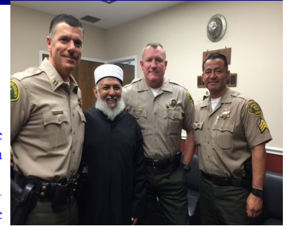
Imam Meets Carson Sheriff heads