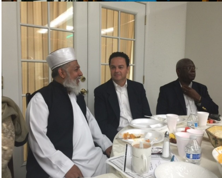
Imam, Mayor & Consul Gen Angola