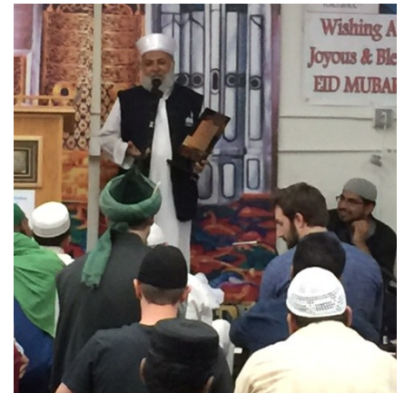
Imam Honored with Plaque of Appreciation by Board for effort for new Masjid