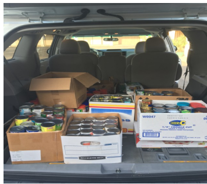
"The best Islam is that you feed the hungry and spread peace among people you know and those you do not know." Prophet