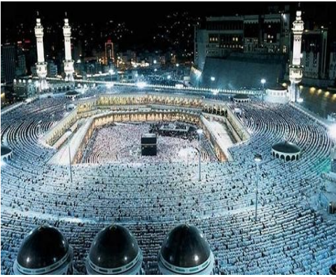
The magnitude of pilgrims performing the Hajj is staggering despite the heat.