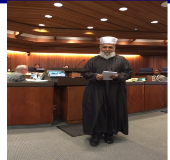
Imam at Carson City Chambers