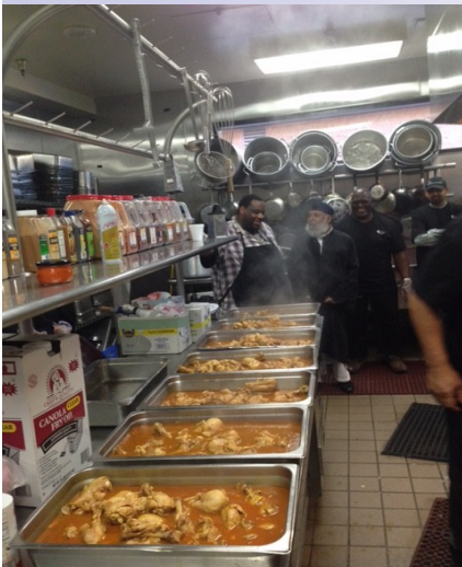
"IIT's Feed the Homeless in LA